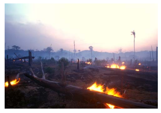
Slash and burn clearing of the rain forest: preparing the land for growing energy-supplying plants.