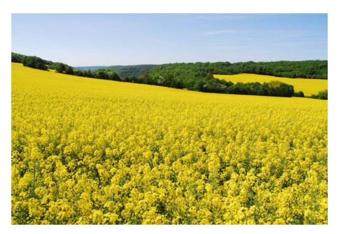
Blooming field of rape: Rape-seed oil is used as food or energy production in the form of biodiesel.