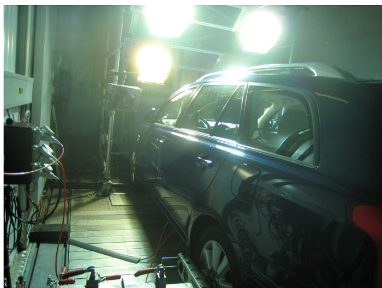
Figure 3: A vehicle on Empa's climate test-bed being subject to high temperature, humidity and "sunlight" levels.