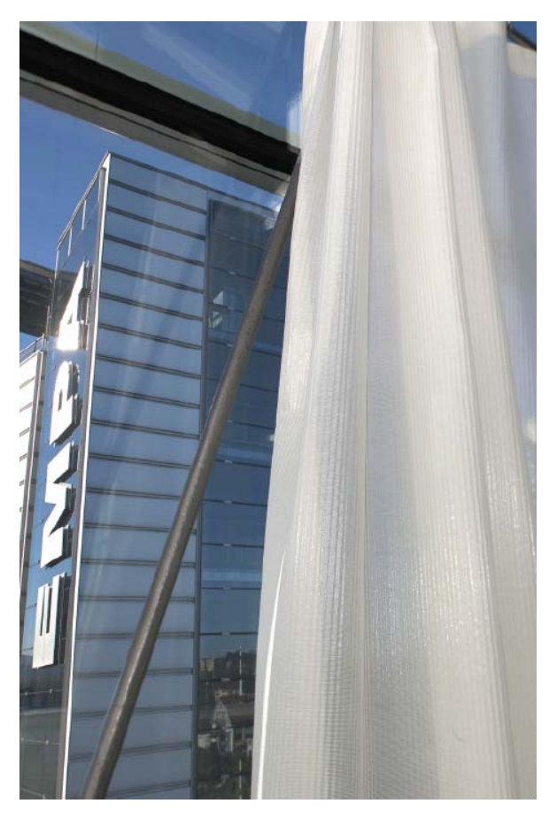
The new sound absorbing curtain «in the field» in a seminar room at Empa in St. Gallen