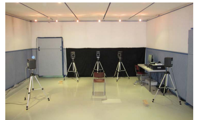
Preliminary loudspeaker set-up for the reproduction of wind turbine noise in the Empa laboratory.

The innovative aspects of acoustical auralization are the development of new algorithms and strategies for simulating spatially explicit sound of wind turbines