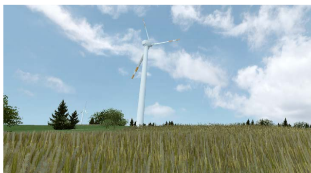
Screen shot of a visual simulation of a landscape with rotating wind turbines and moving grass due to wind.

Within the project VisAsim we develop a visual-acoustic simulation tool, which integrates the realistic soundscape of wind turbine noise into GIS-based 3D landscape visualizations of alternative wind farm scenarios for valuing their impact on the landscape quality. In an interdisciplinary approach realistic acoustic soundscape modeling and GIS-based 3D landscape visualizations are integrated into a single simulation tool. In the first project phase, we will generate for a reference site of an existing wind farm at the Mont Crosin (Switzerland) a reference movie and sound recordings as well as a visual and an acoustic simulation. The latter will then be integrated into a prototype of an audio-visual reproduction system, which will be tested in experiments to proof the validity of the simulation in comparison to the reference movie/sound. In the second project phase, visual-acoustic simulation models for three focus areas with different landscape characteristics will be established and used in virtual reality choice experiments for valuation of alternative wind farm scenarios. Overall, the simulation tool allows for an improved impact assessment, which provides a better, more comprehensible decision basis for designating suitable locations for wind farms, e.g. in federal concepts on the potential areas for wind farms, in cantonal directive plans or in communal land use plans.