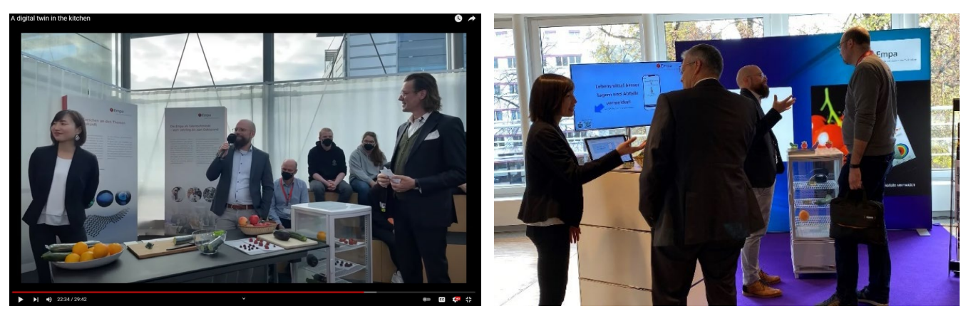
Figure 2: Insights of the outreach events; (a)Scientifica, (b)Tag der Technik, (c)Global Climate Action Symposium, (d)Schweizer Digitaltag, and (e)Swiss Innovation Forum