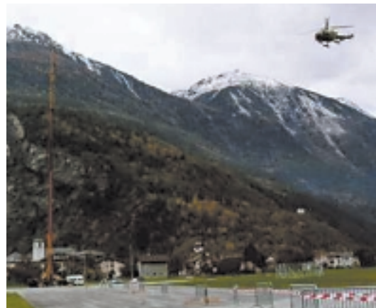
Fig. 1: Alouette III passing the microphone array on the Turtmann airfield.

By means of the measured data and the knowledge of the exact position of the helicopter, the parameters of a mathematic model describing the directivity of the sound emission for different flight operations have been derived. In contrast to the procedures used for fixed wing aircraft, where the directivity pattern is parametrised by a rotational symmetric model, the new model is based on spherical harmonics. With this model it is possible to de-