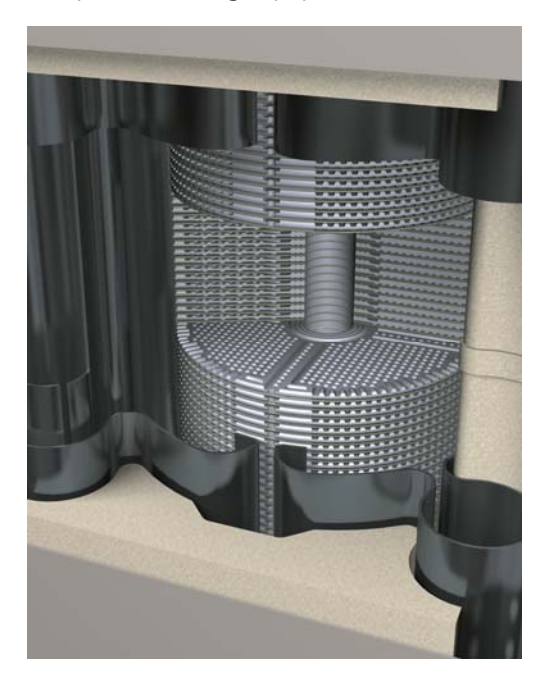
Up to 60 fuel cells are stacked in the Hexis fuel cell heating unit.

The images can be downloaded from www.empa.ch/bilder/