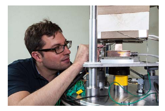
Unique measuring equipment has also been specifically developed at Empa for the HITTEC project.